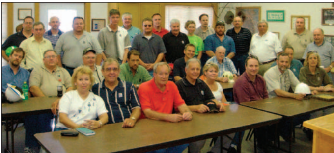
Following the training session and tour, the group poses for a class picture.