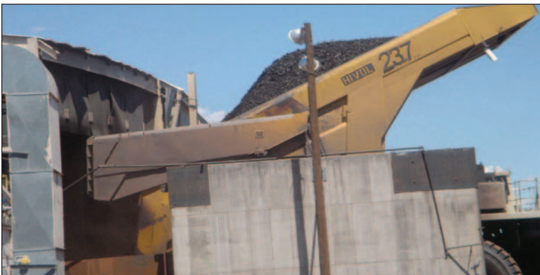
Dumping into the crusher only takes a few seconds. Then, the coal is processed for loading onto—you guessed it—railroad cars destined for power generation plants across the country.