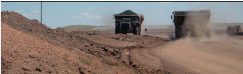
240-, 320- & 360-ton dump trucks are some of the largest vehicles of their type in the world and run 24/7 between the mine and the crushers.