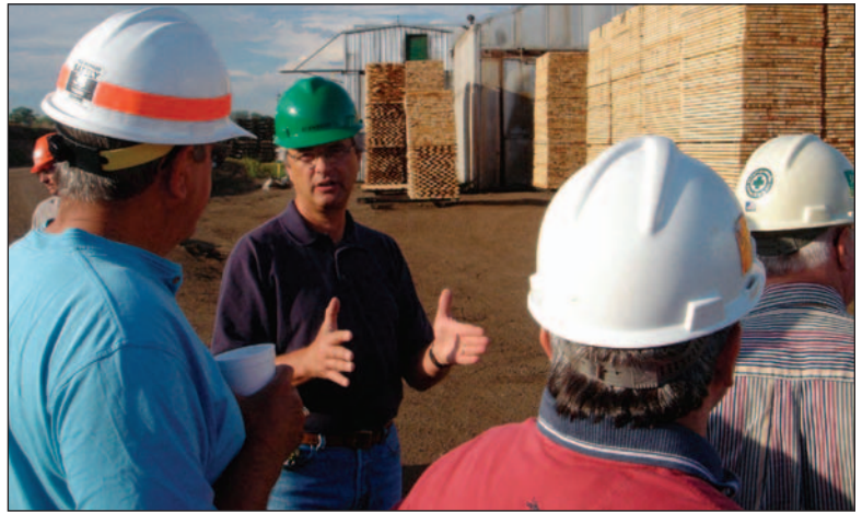
Schmidt also explains the mill operations from debarking to final products.