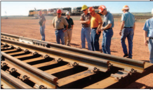
The first stop is the new switching yard at Donkey Creek, where up to 12 parallel tracks will be constructed to maximize train staging for the coal mines. Bosshart explains how wood ties are used for the panelized switches and as transition ties at crossings on mainlines servicing the mines, right.