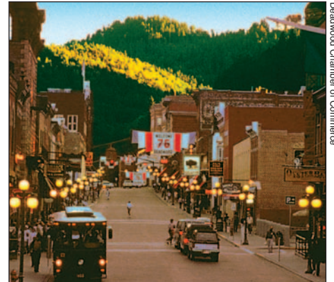
Deadwood Chamber of Commerce

Thompson Industries capped the evening by sponsoring the transportation for the whole group to go up the road to Deadwood for a little entertainment.