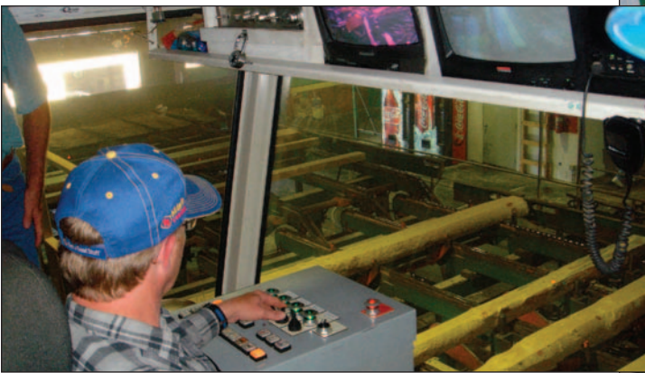
Sawyers and graders take it from there in this high-efficiency operation.