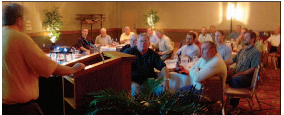
Attendees listen intently to the financing and engineering challenges ahead for the railroad.

Thompson Industries capped the evening by sponsoring the transportation for the whole group to go up the road to Deadwood for a little entertainment.