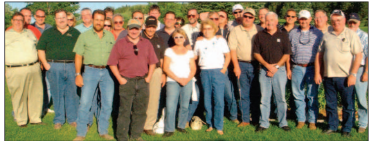
The evening concludes with a dinner sponsored by Wheeler Lumber Company at a local country club, where one last group photo is taken. Then, it's off to Gillette, Wyo., for the next leg of the trip.