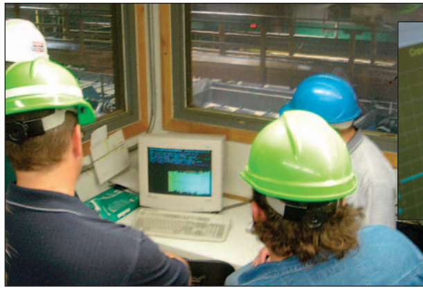
Computer-controlled optimizers scan logs for solutions to the cuts that will yield the highest value.